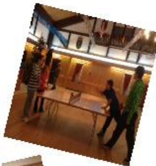
TAG having FUN at the Christmas Party and during our January Ping Pong Tournament.