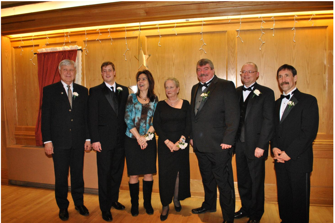
2013 Board of Directors