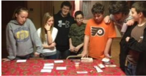
TAG group with the Candy Bar game

Our first meeting will be Sunday, October 5 th from 3 pm - 4 pm (right after the Deutsche Schule session). Come out and join the fun!