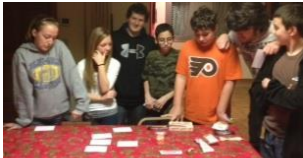
TAG group with the Candy Bar game

Our first meeting will be Sunday, October 5 th from 3 pm - 4 pm (right after the Deutsche Schule session). Come out and join the fun!